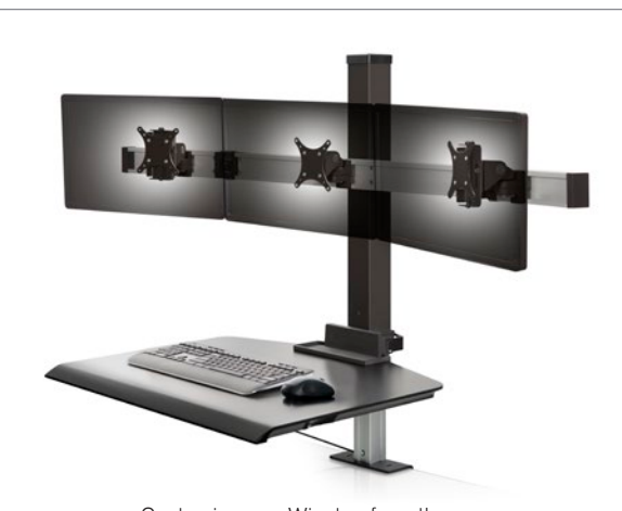
Customize your Winston from the various finish and mounting options available.