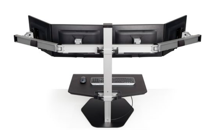
Engineered for stability.