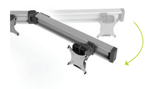
Position monitors flat or in an arch with easy to adjust hinges.