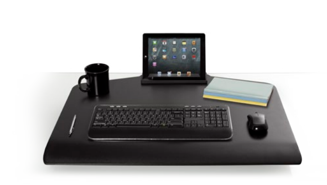
Expansive work surface features a storage tray —keeps items within reach.