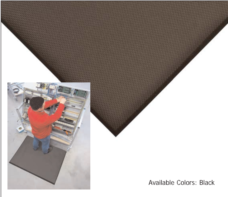
Available Colors: Black

Superfoam ® is an extremely lightweight anti-fatigue mat designed especially for ease of handling and ergonomic comfort. Made from a closed cell PVC Nitrile foam blend, Superfoam ® is highly resistant to greases, oils, animal and vegetable fats. This allows it to be used in areas where occasional overspray and dripping occur such as dishwashing stations and bar areas. And because of its light weight, it is the perfect mat for areas where mats are regularly moved for cleaning like cooking lines, service counters, and food prep stations.