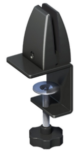
Edge Clamp - Knob (BCEK)