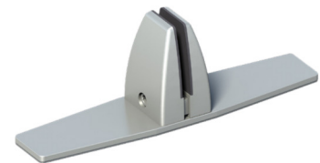
Free Standing (SFS)