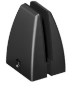
Top Mount (BTM)