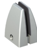
Top Mount (STM)