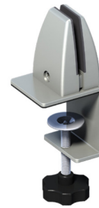
Edge Clamp - Knob (SCEK)